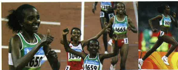
T. Dibaba became the first woman to win the 5 km & 10 km races at the same Olympics. (2008)

www.uefa.com/uefaeuro/season=2008/photos/index.html