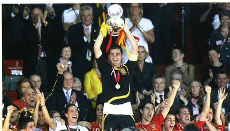
Iker Casillas lifts the trophy after Spain beat Germany 1-0 to win UEFA EURO 2008.

This summer two major sports events will take place in Europe. The UEFA Euro 2012 will be from the 9 th of June to the 1 st of July in Poland and Ukraine and the Olympic Games 2012 will be from the 27 th of July to the 12 th of August in London, England.