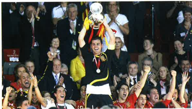
Iker Casillas lifts the trophy after Spain beat Germany 1-0 to win UEFA EURO 2008.

This summer two major sports events will take place in Europe. The UEFA Euro 2012 will be from the 9 th of June to the 1 st of July in Poland and Ukraine and the Olympic Games 2012 will be from the 27 th of July to the 12 th of August in London, England.