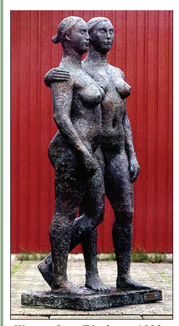
Women from Tórshavn, 1992